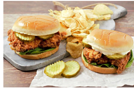
Table of Grace in person on Tuesdays from 12PM until 1PM.

CLLI Licenses: Copyright: 11443112 Streaming: 20494769