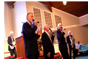
Sunday, June 19, 10AM: Glory Road will be here. Please join us!

Year To Date Offerings Budget Offering Needed to Date: $55,642.20 Received to Date: $41,893.34 Under Budget: -$13,748.86