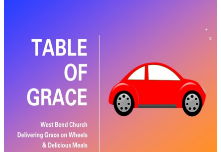
Table of Grace Ministry Delivering Grace on Wheels and Delicious Meals

Thank you to all of our cooks, cleaners, buyers and delivery persons.